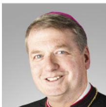
ARCHBISHOP ANTHONY FISHER

Archdiocese of Sydney Topic: Humanae Vitae 50 years on